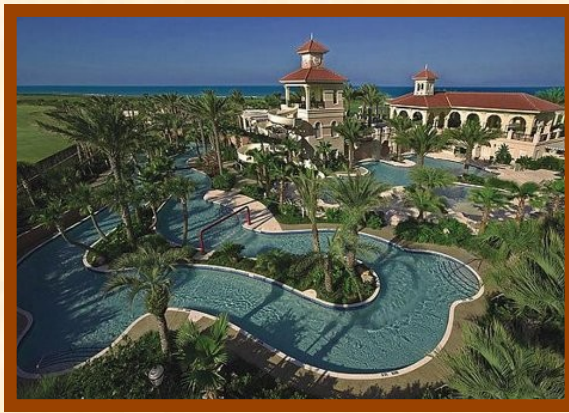
Every resort suite perfectly captures breathtaking ocean or golf course views

36 Holes of Championship Golf include, The Ocean Course by Jack Nicklaus and the Conservatory Course by Tom Watson. A 9 Hole Putting Course, 2 Driving Ranges and Practice Greens are also available.