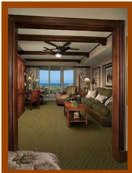
← One bedroom resort suite

possibly imagine, including exceptional golf, full-service spa and fitness center, an elaborate multi-level water and swim pavilion and world-class dining. The property features luxurious appointed suites, villas and private homes.